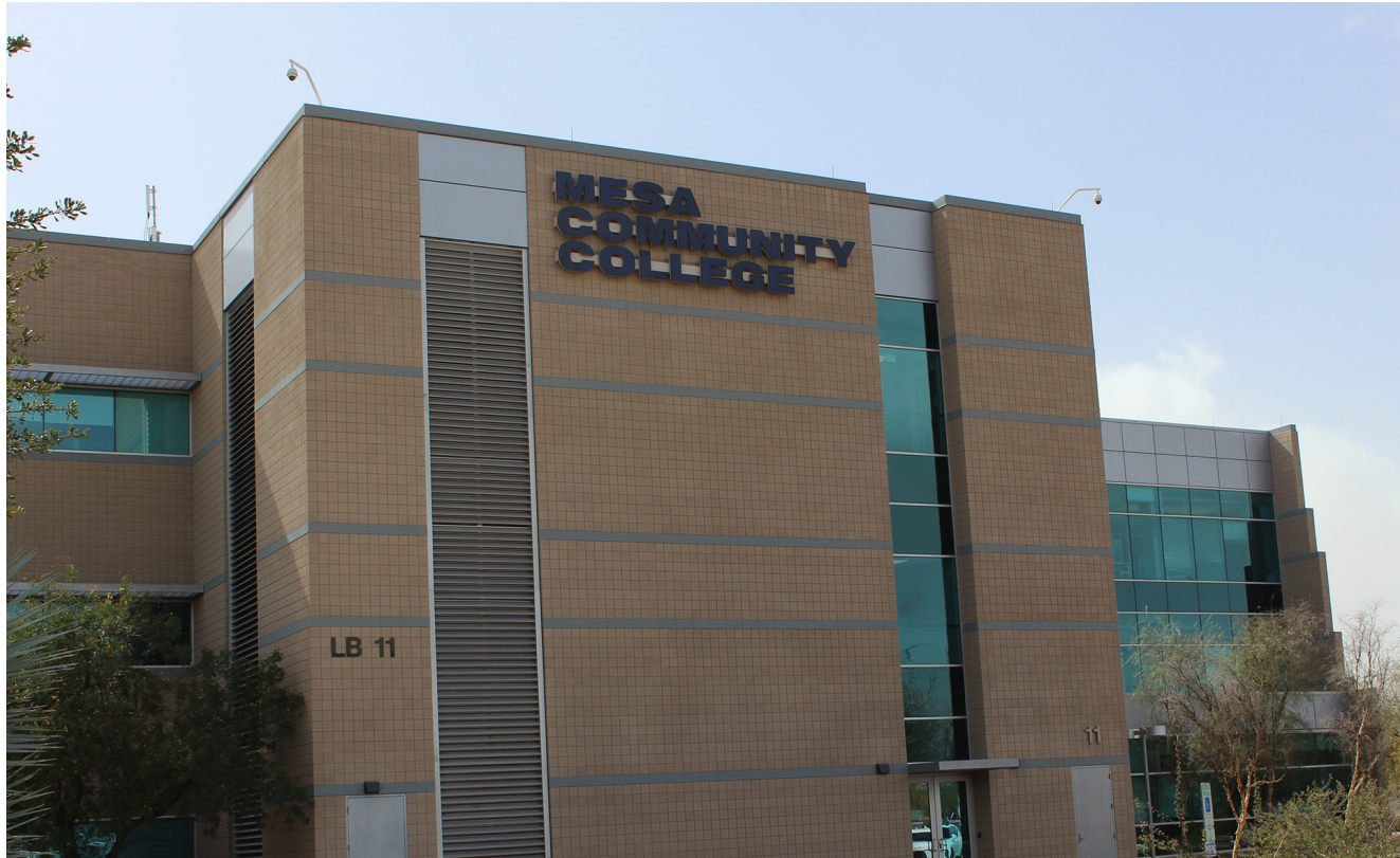
The north side of the Mesa Community College library at the Southern and Dobson campus on Feb. 22, 2023.